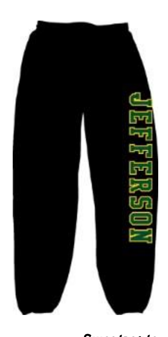
Set = $35.00