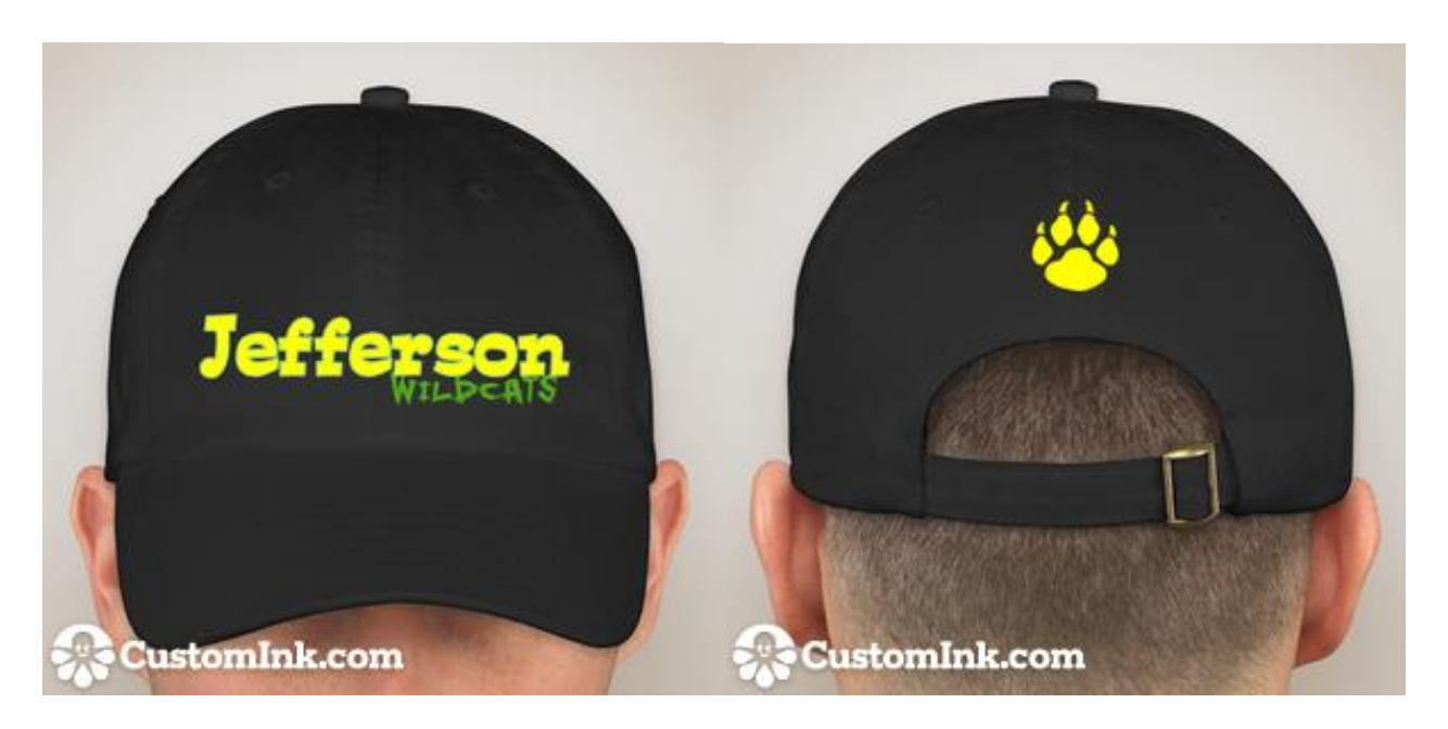
Hat = $15.00