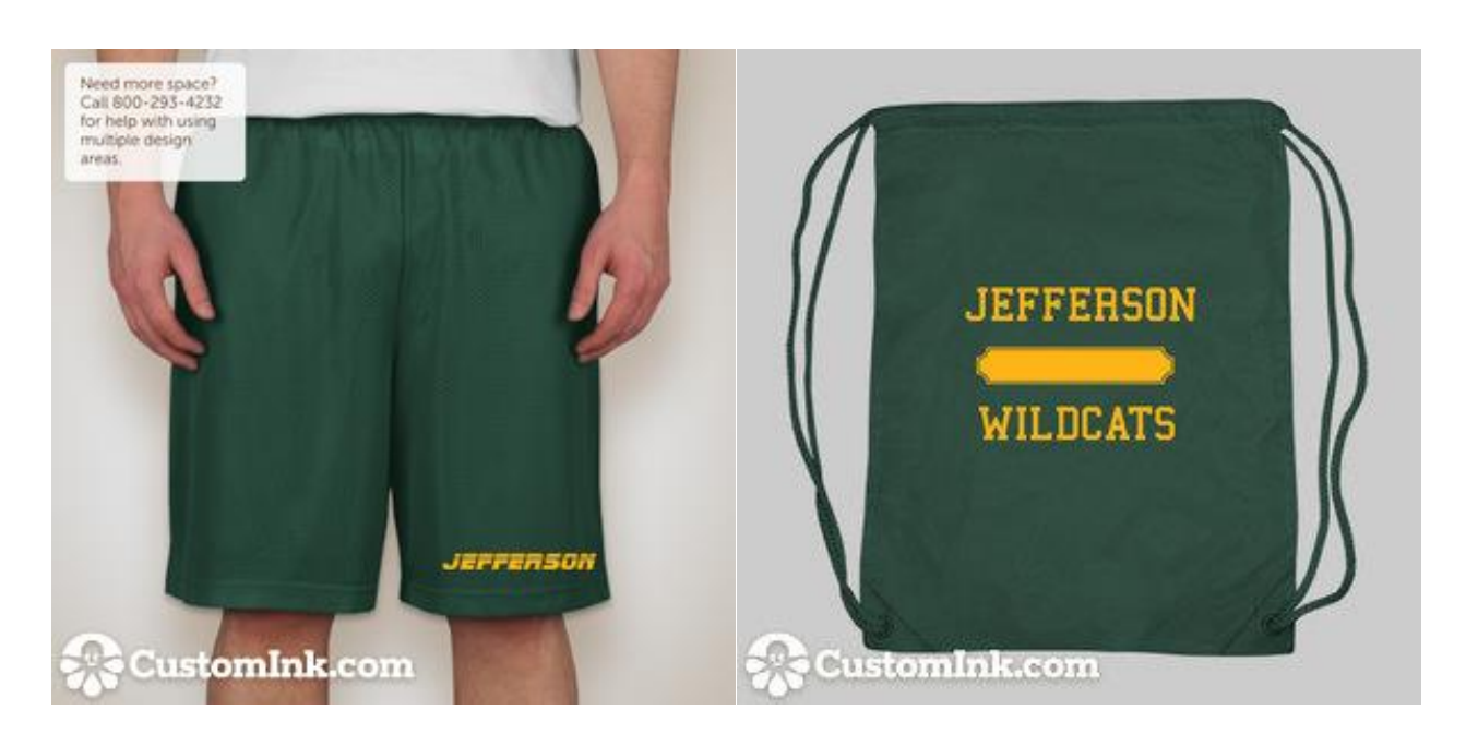
Shorts = $15.00