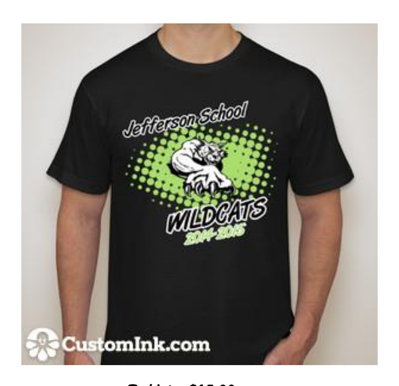
T-shirt = $15.00