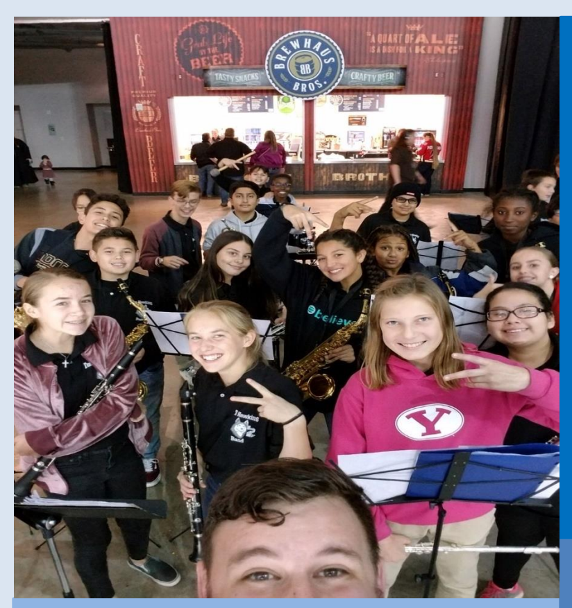
"Living and learning with purpose"