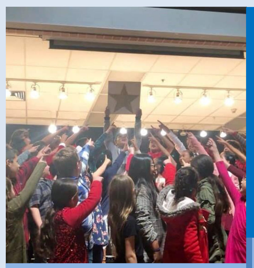
"Living and learning with purpose"