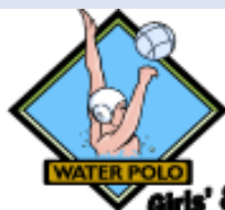
Girls' & Boys' Waterpolo