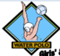
Girls' & Boys' Waterpolo