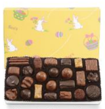
Assorted Chocolates Milk and dark decedence. Delivered in seasonal wrap. 1 lb $21.00 #318