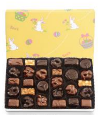
Nuts & Chews Yummy, crunchy and chewy. Delivered in seasonal wrap. 1 lb $21.00 #334