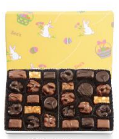
Nuts & Chews Yummy, crunchy and chewy. Delivered in seasonal wrap. 1 lb $21.00 #334