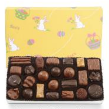
Assorted Chocolates Milk and dark decadence. Delivered in seasonal wrap. 1 lb $21.00 #318