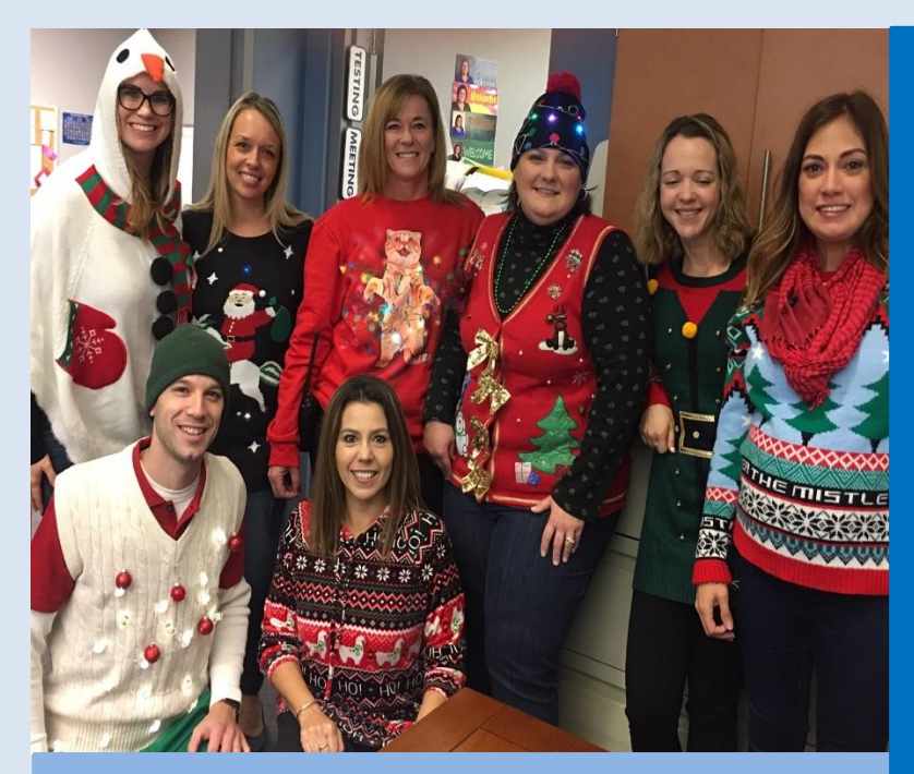
"Living and learning with purpose"