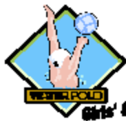
Girls' & Boys' Water polo